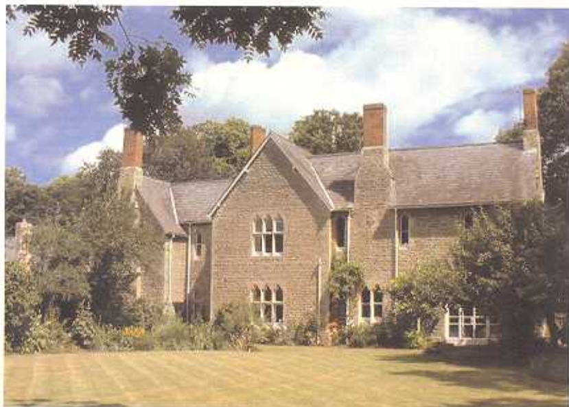
Rectory grounds are expertly maintained by BCB.

E stablished in 2002 as part of an Innovation and Good Practice project in partnership with Soha, (South Oxfordshire Housing Association), Berinsfield Community Business (BCB), is leaping ahead with pioneering community services.